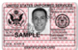
DD Form 2 (Reserve Retired)

Retired Reserves Retired National Guard Eligible