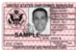
DD Form 1173-1

Retired Reserves Retired National Guard Eligible