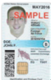
Common Access Card

Active Military Foreign Affiliate Eligible only with this ID (no other ID accepted)