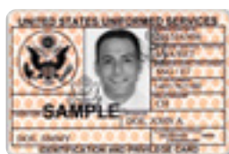
DD Form 2765

100% Disabled Veterans Medal of Honor Recipients Other Benefits-eligible Categories Eligible