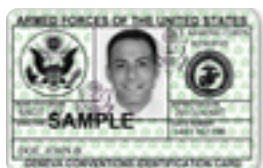
DD Form 2 (Reserve)