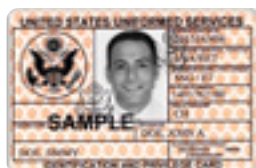
DD Form 1173

100% Disabled Veterans Medal of Honor Recipients Some Retirees Eligible