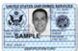
DD Form 2 (Retired)

100% Disabled Veterans Medal of Honor Recipients Some Retirees Eligible