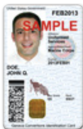
Common Access Card